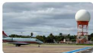
Civil Aviation Radar