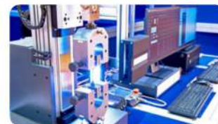
ATE Signal Source